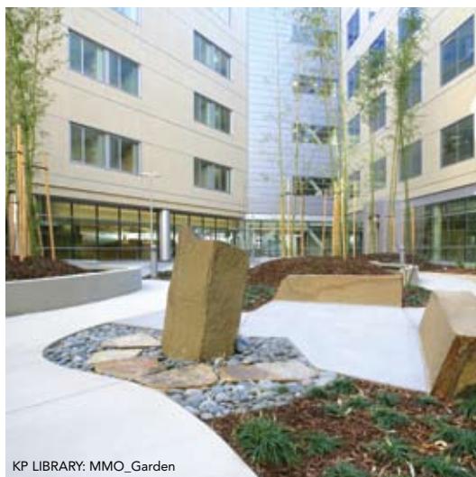
KP LIBRARY: MMO_Garden

Green construction represents just part of our overall environmental efforts. We also practice environmentally responsible purchasing, energy conservation, safe chemical policies, and more.