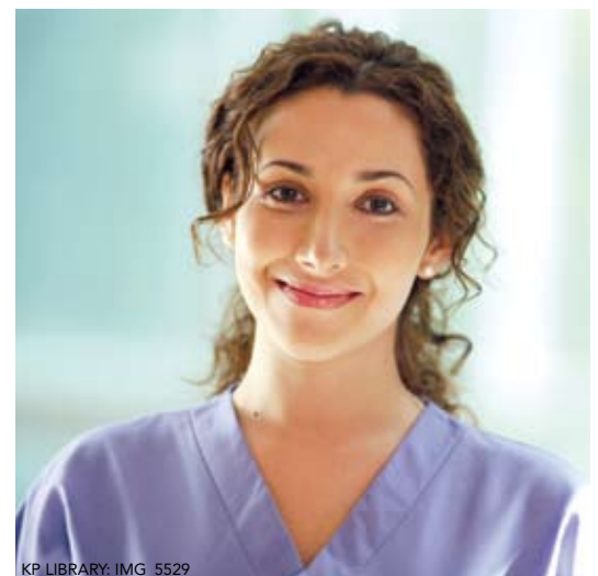
KP LIBRARY: IMG_5529